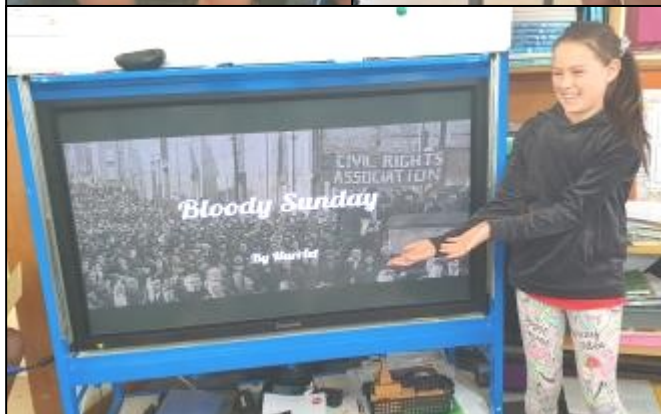
Room 4 shared their home learning and Pod 1 made toast with toppings