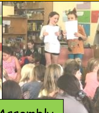
Pod 2's Sharing Assembly