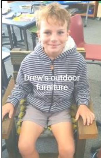
Drew's outdoor furniture